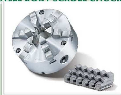
規格表 > Specifications