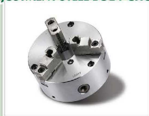
規格表 > Specifications