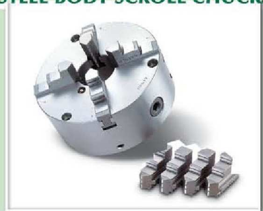
規格表 > Specifications