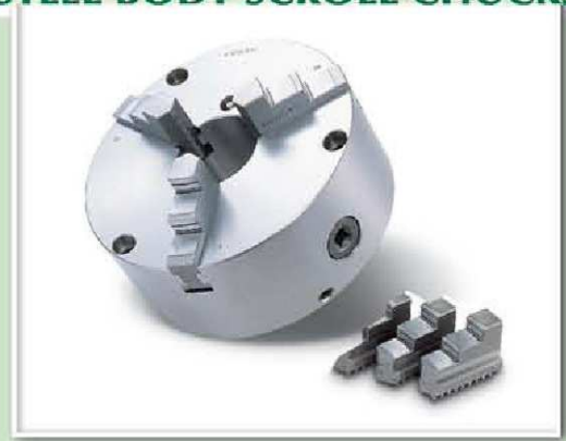
規格表 > Specifications