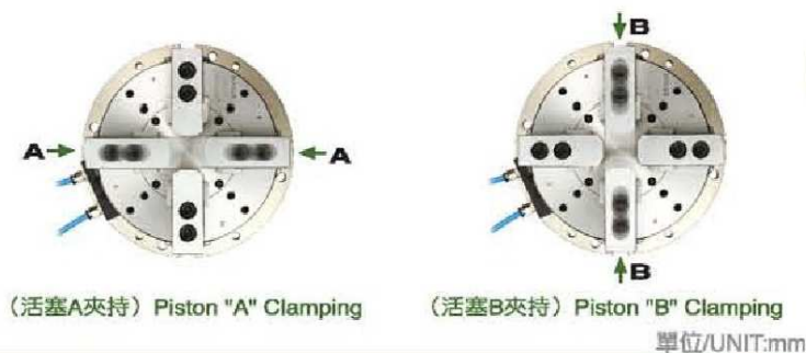
(活塞A夾持) Piston "A" Clamping

兩段分割夾持，自定中心 4-jaws clamping and self-center